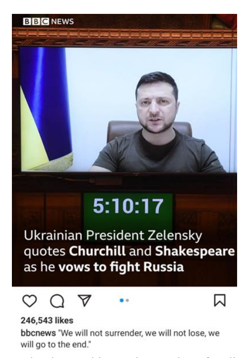
Figure 1. Ukraine's President Zelensky speaking to the member of parliament of the United Kingdom